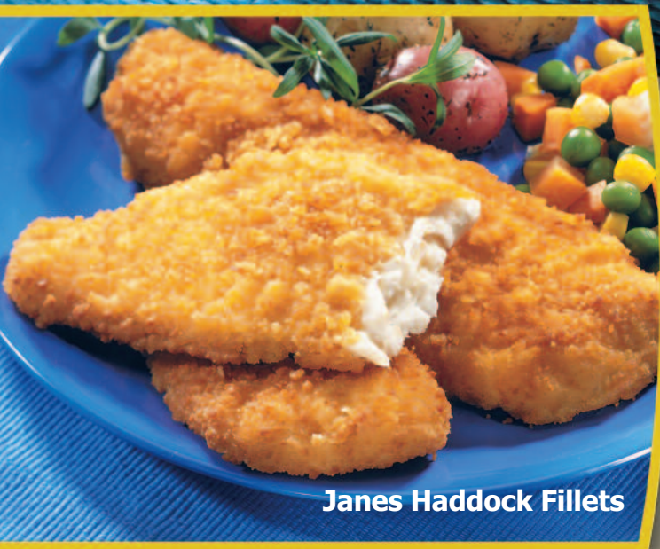
Janes Haddock Fillets